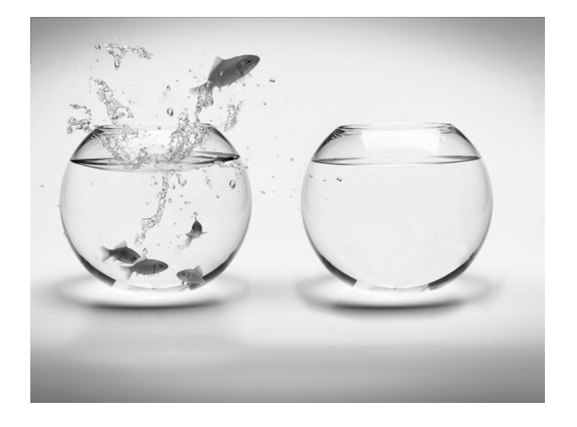
Figure 1: Reflections on corrugated liquid/gas interface, with obstacles. Rendering with 300 dpi.